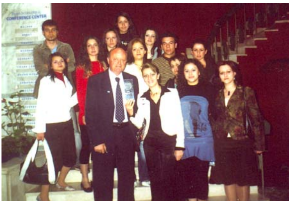
GJIROKASTRA SIFE TEAM